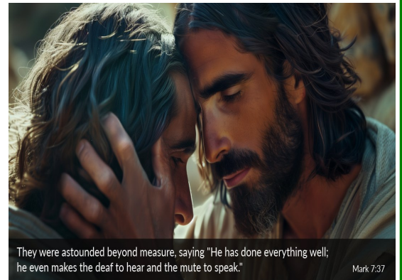
They were astounded beyond measure, saying "He has done everything well; he even makes the deaf to hear and the mute to speak."

Although the eschatological future is already present to us, it is only unfolding, it has not yet opened completely. We still judge each other by appearances. We still miss the presence of God in the poor and the dispossessed, in those who suffer from disease or war or loneliness. We still shun those of another race, or those who have been shaped by another culture, or those who worship God in a different way. Although the eschatological future is already present, we have not yet put aside all of the biases of the past, we have not yet been fully transformed. But God has spoken, God has come to save us. God is trustworthy; God keeps faith forever.